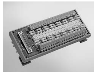
ADAM-3951 50-pin DIN-rail Wiring Board w/ LED Indicators

USB-4751/L, PCI-1737U, PCI-1739U, PCL-722, PCL-724, PCL-731