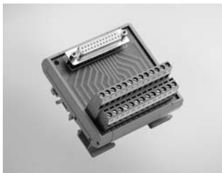
ADAM-3925 DB25 DIN-rail Wiring Board

PCI-1735U, PCL-711B, PCL-720+, PCL-726, PCL-727, PCL-730, PCL-812PG, PCL-816, PCL-818 Series, PCL-836