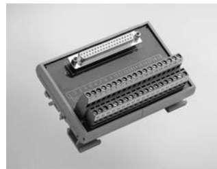
ADAM-3937 DB37 DIN-rail Wiring Board