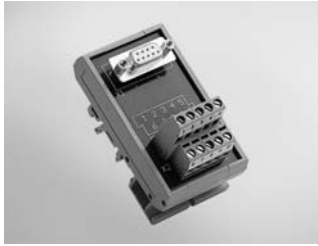
ADAM-3909 DB9 DIN-rail Wiring Board