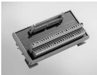
ADAM-3950 50-pin DIN-rail Flat Cable Wiring Board

PCI-1713U, PCI-1715U, PCI-1718HDU, PCI-1720U, PCI-1730U, PCI-1733, PCI-1734, PCI-1750, PCI-1760U, PCI-1761