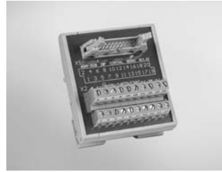
ADAM-3920 20-pin DIN-rail Flat Cable Wiring Board

PCI-1714U/UL, PCL-728, PCL-740, PCL-741, PCL-743B, PCL-745B