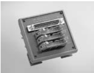
ADAM-3968/20 68-pin SCSI to 3 20-pin Box Header Board

PCI-1710U/UL, PCI-1710HGU, PCI-1711U/UL, PCI-1712/L, PCI-1716/L, PCI-1741U, PCI-1742U, PCI-1747U, PCI-1721, PCI-1723, PCI-1751, PCI-1753, PCI-1723, PCI-1780U