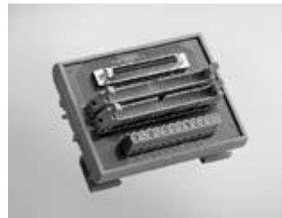
ADAM-3968/50 68-pin SCSI to 2 50-pin Box Header Board