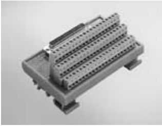
ADAM-3962 DB62 DIN-rail Wiring Board