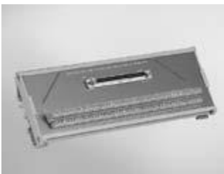
ADAM-39100 100-pin DIN-rail SCSI Wiring Board