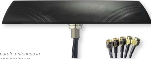
5 separate antennas in one enclosure