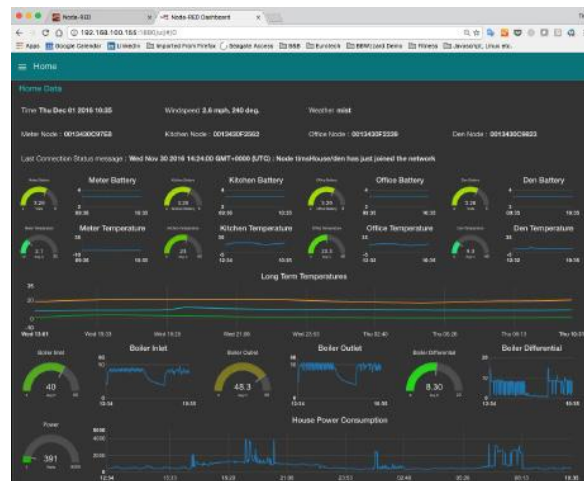
NodeRED - at-a-glance dashboards