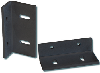
Rack Mounting Ears