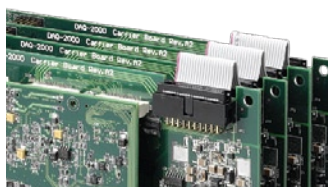
SSI bus cable for multiple card synchronization (for DAQ/DAQe-2000 series)

SSI Bus cable for two, three, and four devices