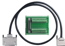
Terminal board DIN-68S-01 & 68-Pin SCSI-VHDCI cable ACL-10568-I

* For more information on mating cables, please refer to P2-61/62.