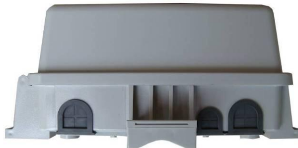
ENC-PL Bottom Panel with Universal Feedthru