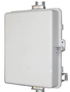
ENC-PL Polycarbonate Enclosure