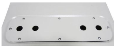
ENC-ST Bottom Panel Cutouts