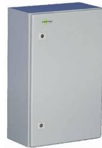
ENC-ST Steel Enclosure