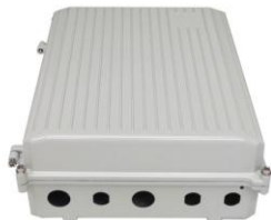
ENC-DC Bottom Panel Cutouts

Features include a hinged cover for easy access and weatherproof feedthru's for cables and wiring. The ENC-DC comes with two RJ45 feedthru which allows passing of an RJ45 connector to make the entire enclosure field replaceable. It also has three cutouts for an N Female connector for attaching external antennas. Hole Plugs are included for the N Cutouts if all aren't needed. The ENC-PL has 3 weatherproof universal cable feedthru's. The ENC-ST has four cutouts for RJ45 Feedthrus (included) and DIN rail mounts on both interior sides as well as on the door. The ENC-St also comes with a removable battery shelf.