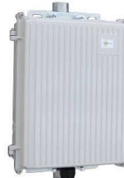
ENC-DC Die Cast Enclosure