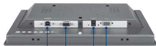
Touchscreen (USB) Touchscreen (RS-232) DC Jack 12V dc (100 ~ 240V AC adapter included) VGA Port