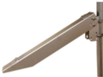
30W Solar Mount

Batteries are an Advance Glass Matt (AGM) type which have good all temperature performance.