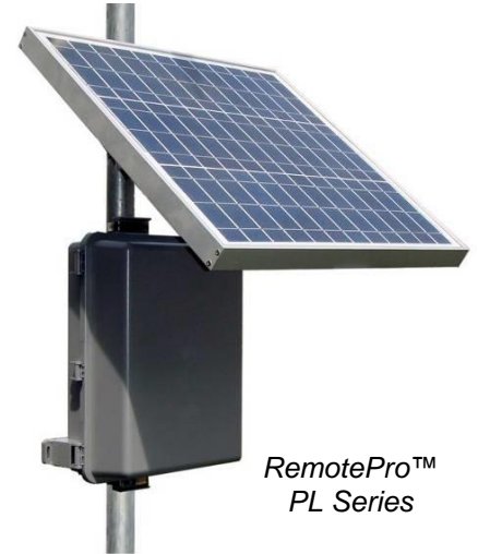
RemotePro™ PL Series