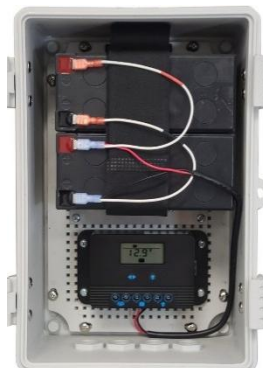
20A PWM Controller Inside