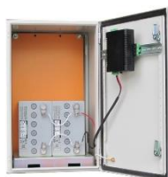
RPST with 100Ah of battery

The systems come with all cabling required to connect the batteries to the controller and 20' outdoor rated cable to connect the solar panels to the controller.