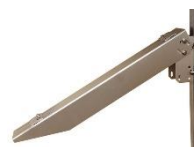
80W Solar Mount