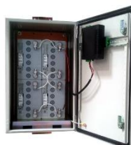
RPST with 200Ah of battery