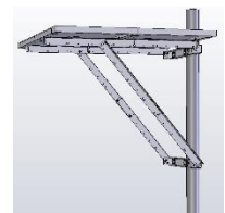
160W / 320W Solar Mount