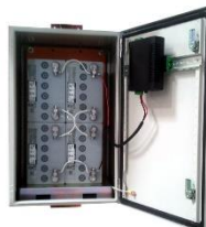
RPST with 200Ah of battery