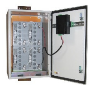
RemotePro™ ST Series