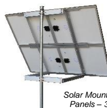
Solar Mount with 4 Panels - 320W