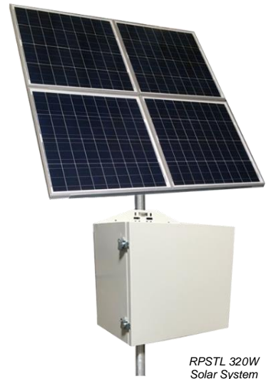
RPSTL 320W Solar System

The systems come with all cabling required to connect the batteries to the controller and 20' outdoor rated cable to connect the solar panels to the controller.