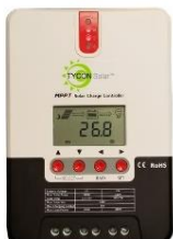
MPPT Solar Charge Controller