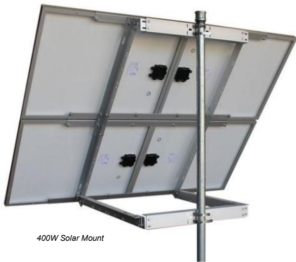
400W Solar Mount