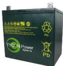
AGM 12V 52Ah Battery