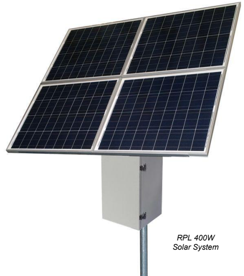
RPL 400W Solar System