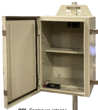
RPL Enclosure interior without batteries or controller