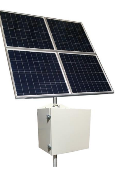
650/1300W Solar Mount