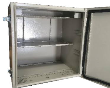
RPSTL Enclosure interior without batteries or controller