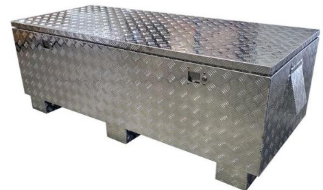
RPAL Diamond Plate Aluminum Ground Mount