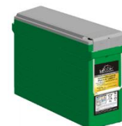
AGM 12V 180Ah Battery