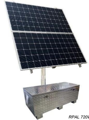
RPAL 720W Solar System