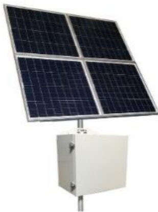
RPSTL 400W 4 Panel Solar System