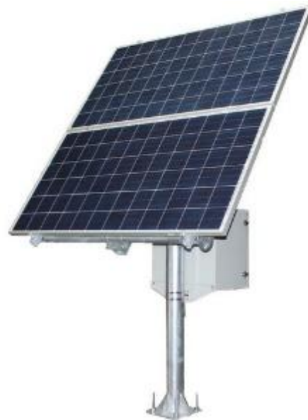
RPSTL 720W 2 Panel Solar System