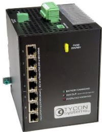
TPDIN-SC48-20 MPPT Controller with manageable 7 Port Gigabit PoE Switch