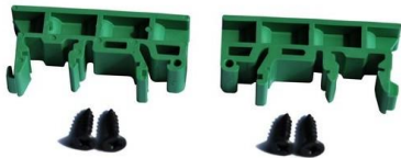
DIN Rail Adapters Included