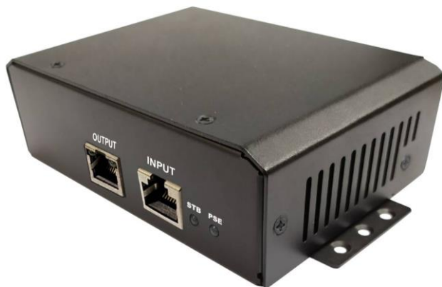
TP-DC-1256Gx-VHP w/ Metal Housing