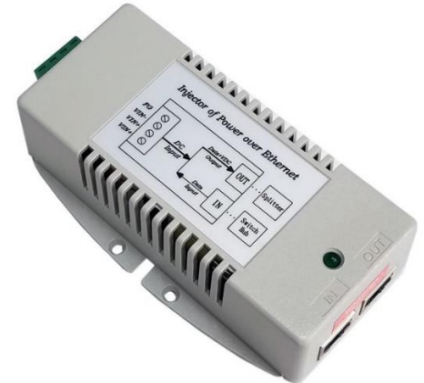
TP-DCDC-1224G-4P 24W 4 Pair Gigabit PoE