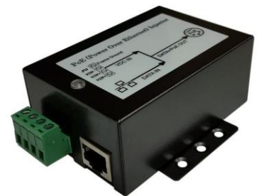
TP-DCDC-1248M (Metal Enclosure)