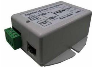
TP-DCDC-1248GAD 17W 802.3af