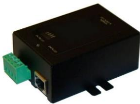
TP-DCDC-1248GAD-M (Metal Enclosure)