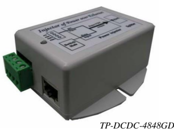
P-DCDC-48480 17W 802.3af