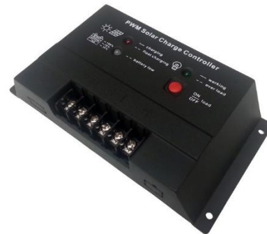
12V / 24V Solar Charge Controller