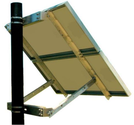
140W and 280W Kit Mount System