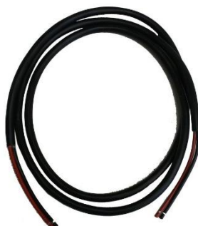
20' Outdoor Rated 12AWG Cable