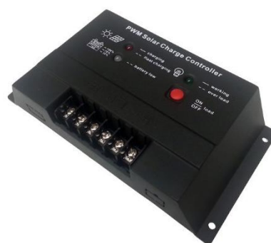
12V / 24V Intelligent Solar Charge Controller