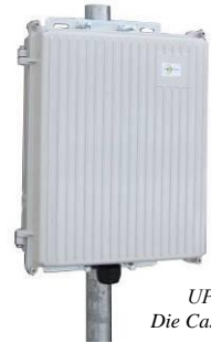
UPSPro™ Die Cast Enclosure