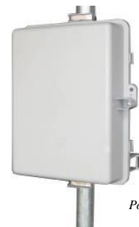
UPSPro™ Polycarbonate Enclosure