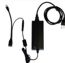
POE Power Supply/Inserter