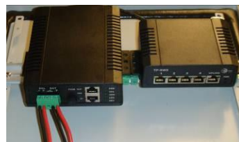
DIN Rail Mounted Controller / Switch